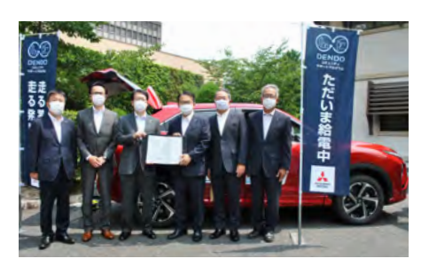
Conclusion of a disaster cooperation agreement (WEB) https://www.mitsubishi-motors.co.jp/carlife/phev/dcsp/ (only in Japanese)

For details, please see the feature on page 27, as well as our website.