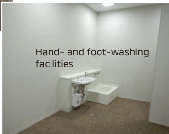
Prayer room in the Okazaki area

Signs on the ceiling indicating the direction of worship