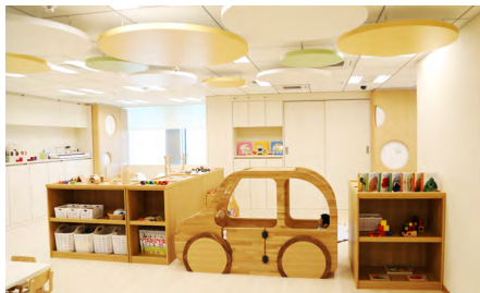
Dia-Kids Tamachi, a day-care center for employees

In addition, we regularly bring in outside instructors to conduct training for employees who are working while raising children as well as training for managers with subordinates on childcare leave or who are raising children. Through these sessions, employees with children learn how they should approach long-