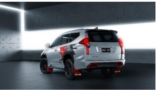
Pajero Sport Ralliart