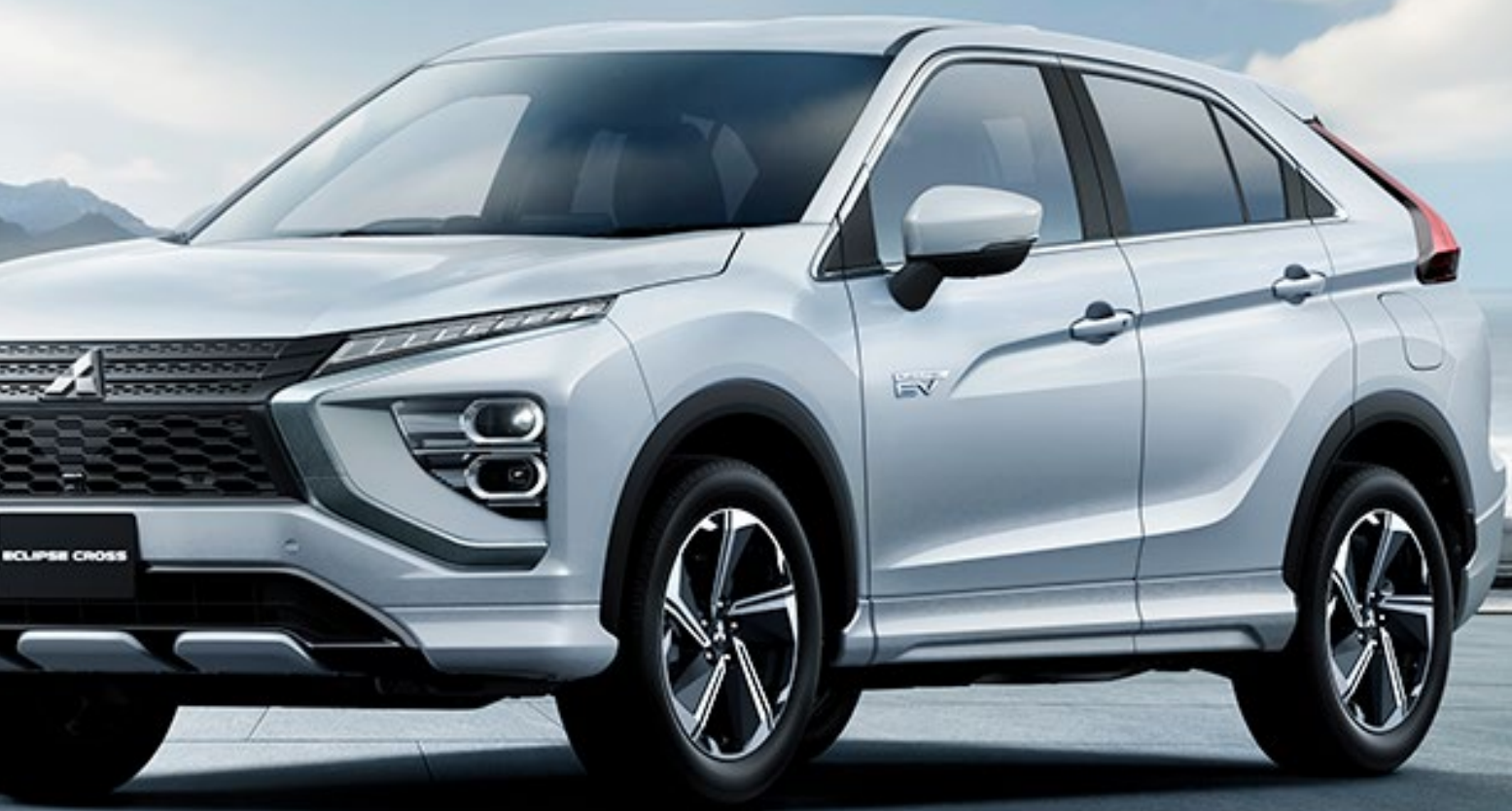
Eclipse Cross PHEV