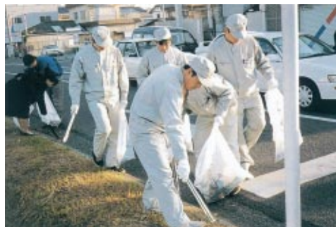
Cleaning up in Mizushima