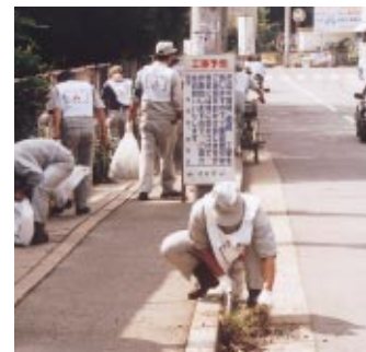
Cleaning up in Kyoto